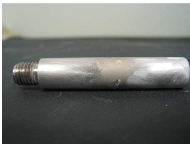
Rapid Scale Test with Device