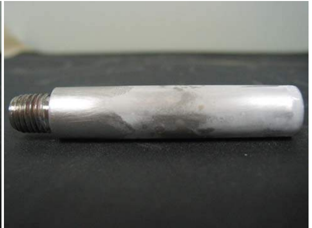
Rapid Scale Test with Device