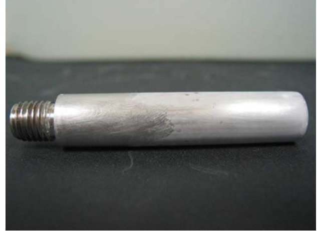
Rapid Scale Test with Device