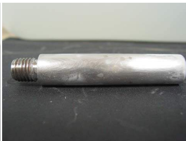
Rapid Scale Test with Device